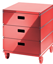
Glossy colour Red 1120 C