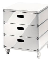
Glossy colour White 1735 C