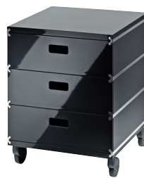
Glossy colour Grey Anthracite 1420 C