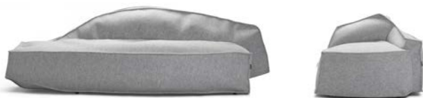
AIRBERG Sofa & Easy Chair By Jean-Marie Massaud