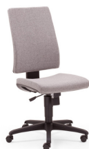
INTRATA O12 GTS TS16