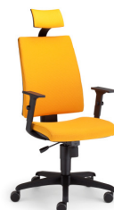
INTRATA O12 HRU R20N TS16