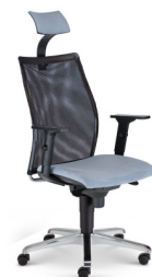
INTRATA O 13HRU STEEL 36 CHROME