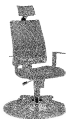
INTRATA O12HR GTP36 TS16