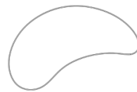
Tablet B 25 x 59 cm

Writing tablet in laminated plywood and coated with Micro Power lacquer.